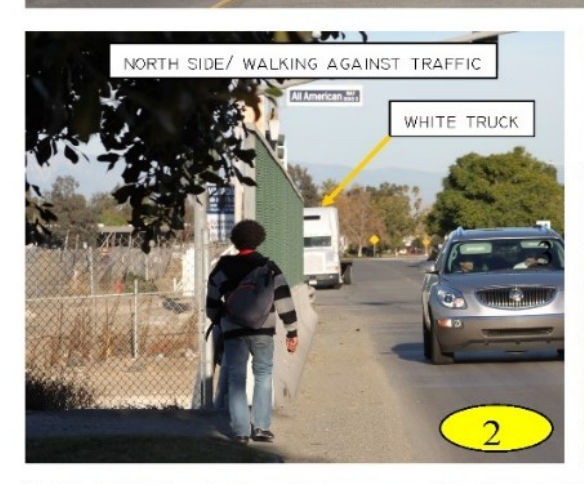
Figure 2: Project Area Existing Conditions