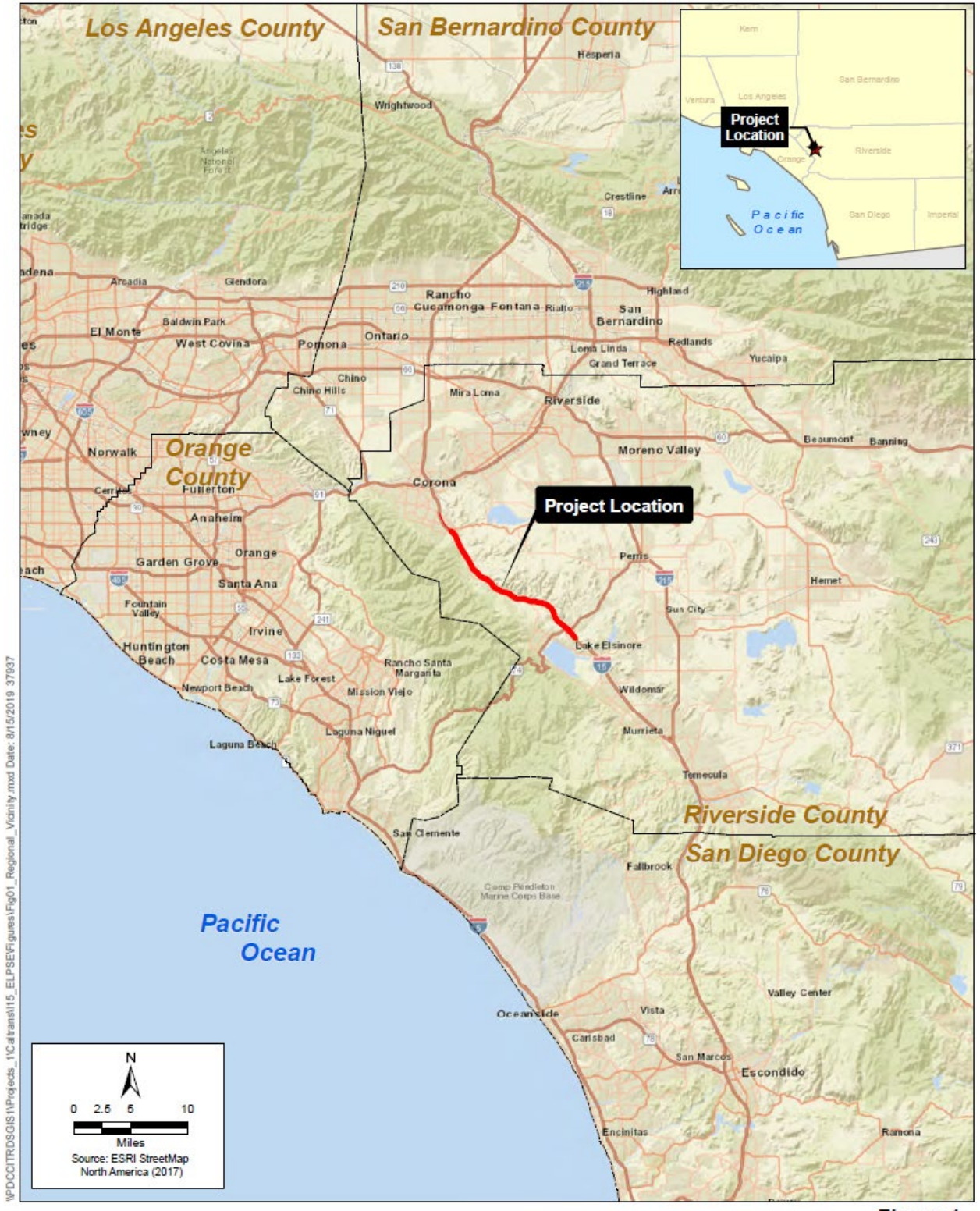
Figure 1 Project Vicinity Interstate 15 Express Lanes Project Southern Extension (I-15 ELPSE)