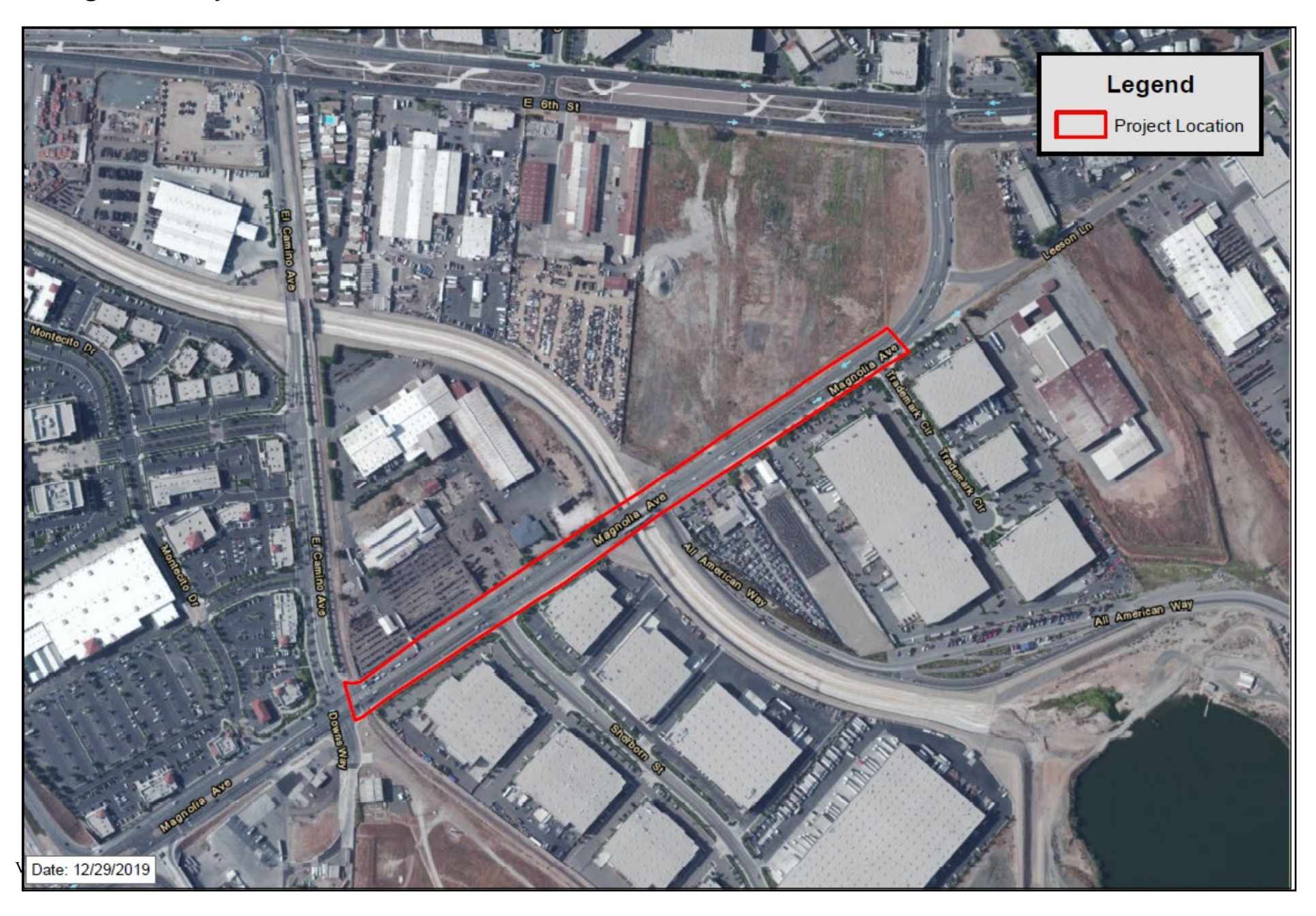
Figure 1 – Project Limits