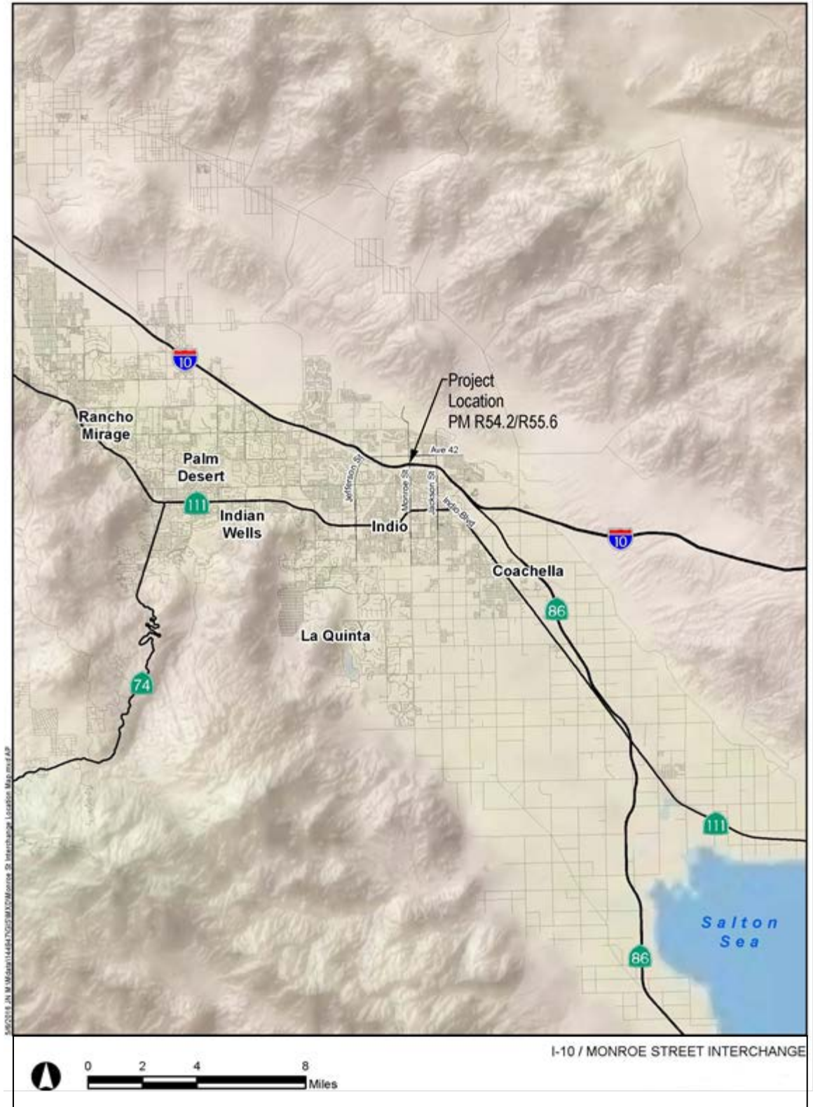
Figure 1 – Project Area