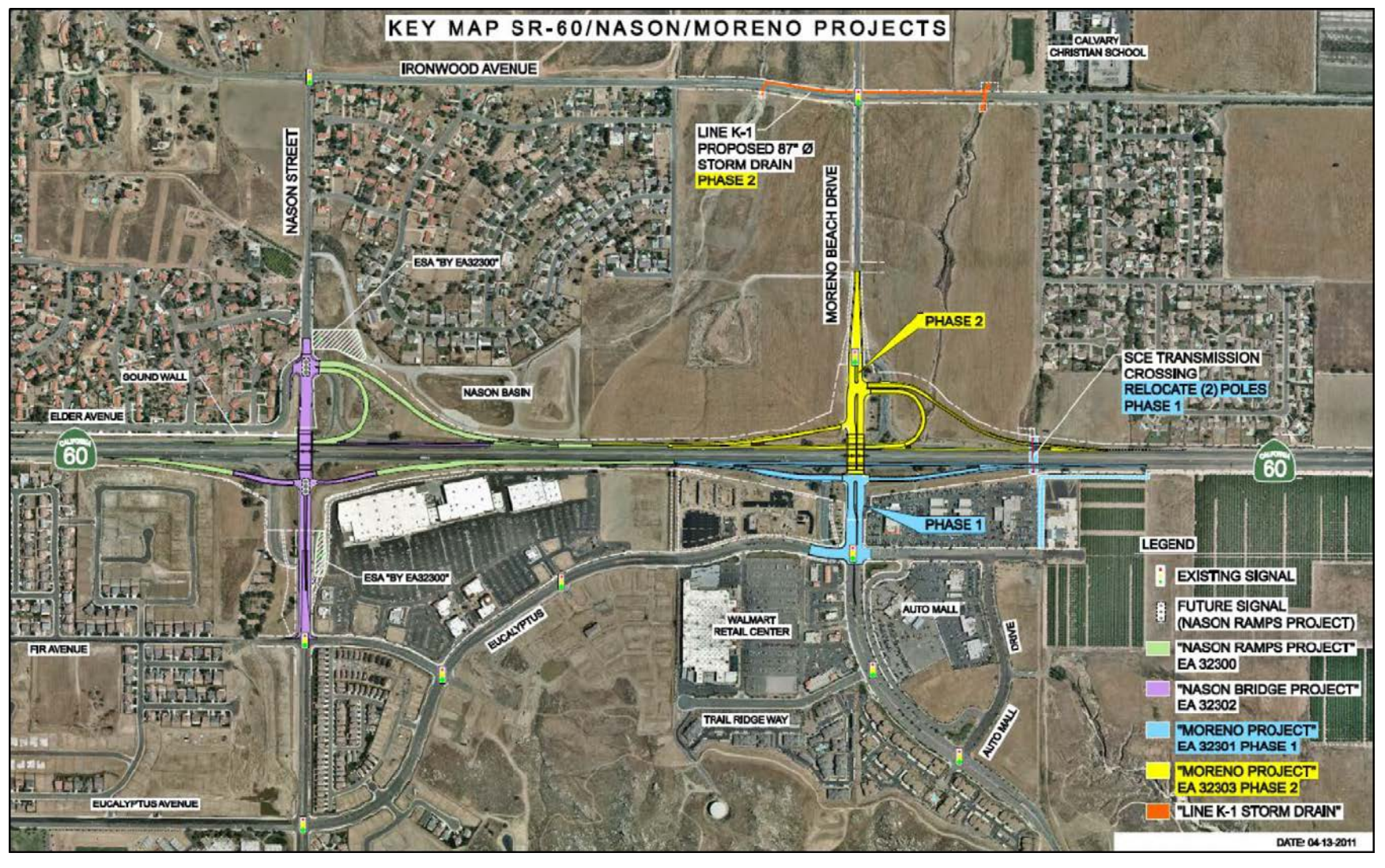
Figure 2 – Project Location